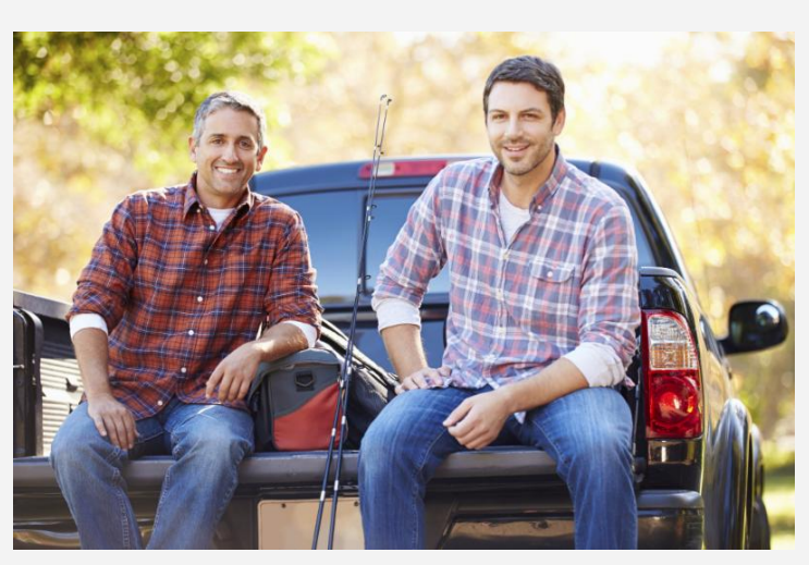
Read More about Hormone Therapy for Men

Benefits of testosterone replacement therapy (TRT) are clearly established: improved sexual function, increase in lean muscle mass and strength, mood and cognitive function, with